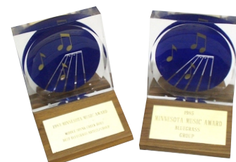
Minnesota Music Awards

“Very smooth and professional, good listening!” Bluegrass World